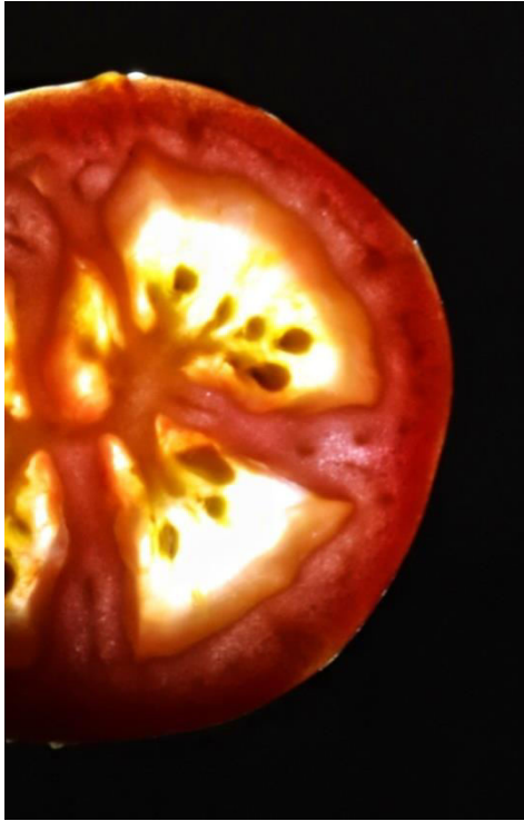
A. Naga Nikhil from MSCs 3A stood first