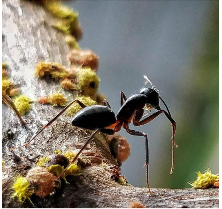
Yaswanth from B.Com Computers 2E stood second