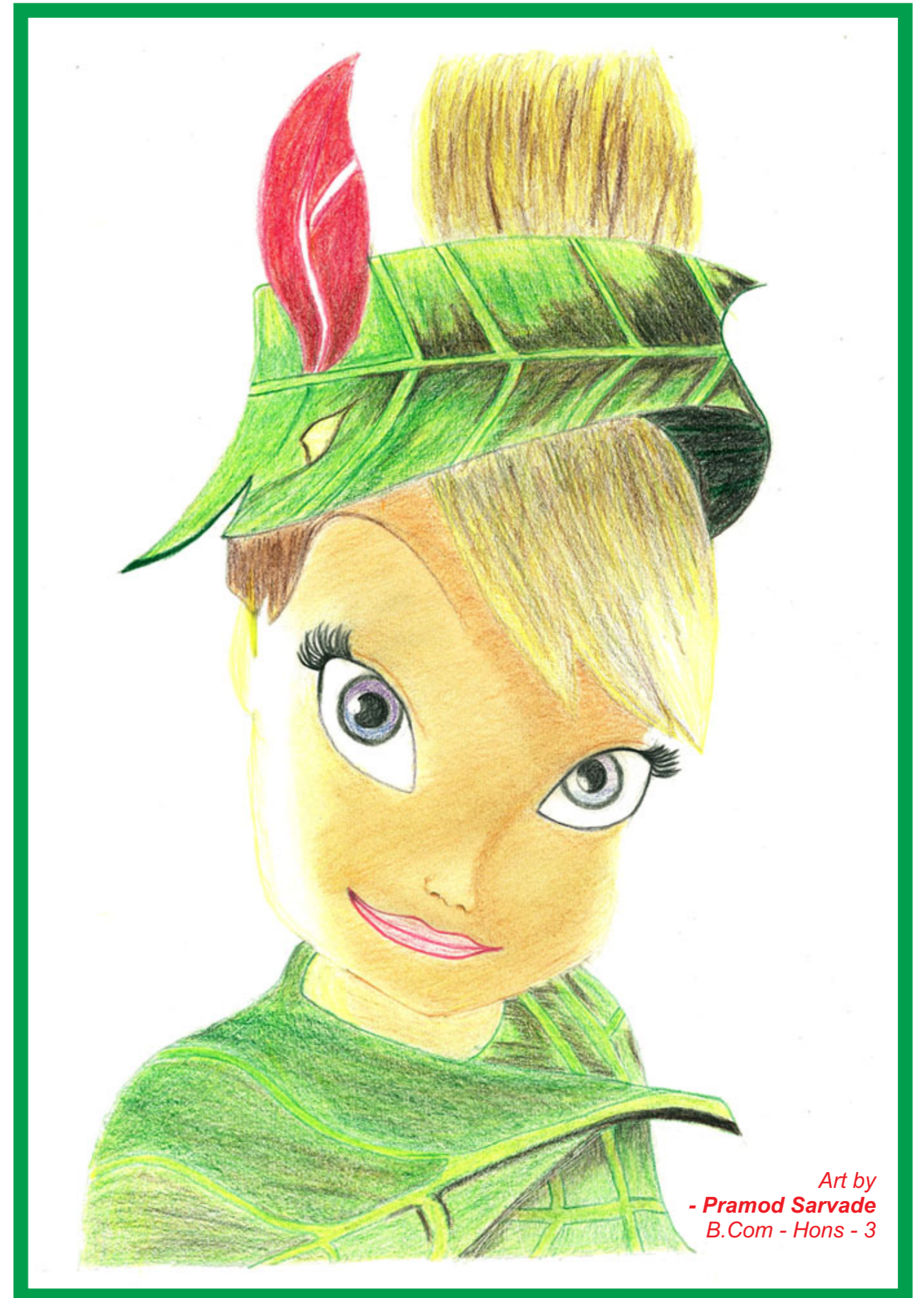
Art by - Pramod Sarvade B.Com - Hons - 3