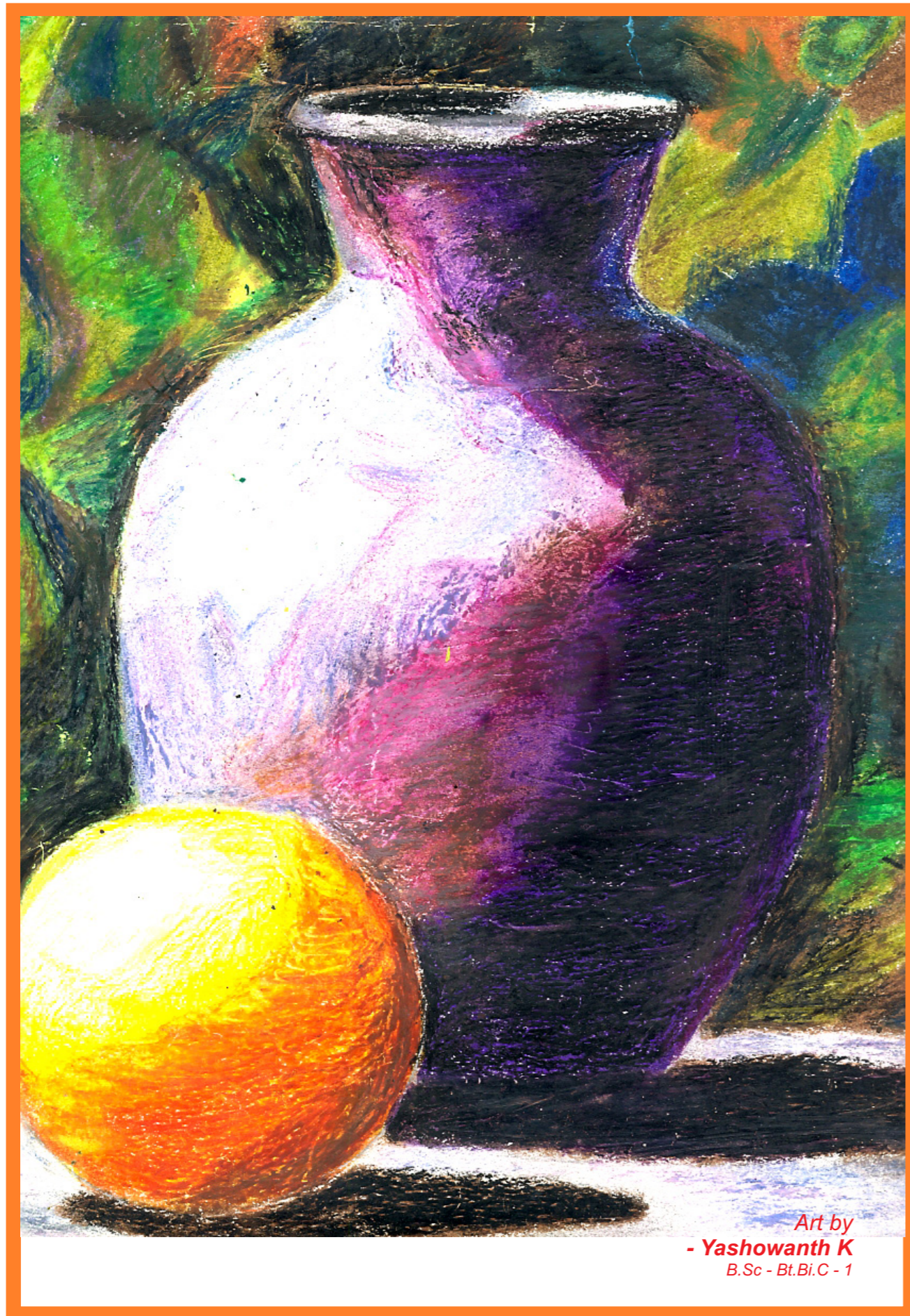
Art by - Yashwanth K B.Sc - Bt.Bi.C - 1