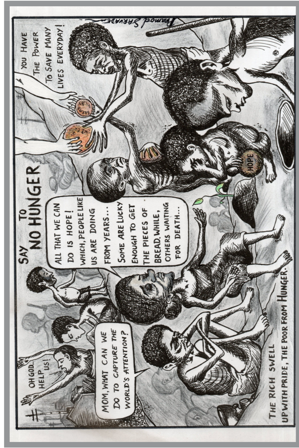
Art by - Pramod Sarvade B.Com - Hons - 3