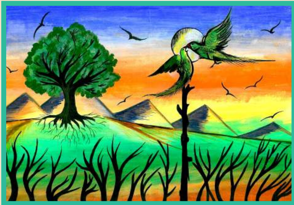
Art by - Pramod Sarvade Alumnus