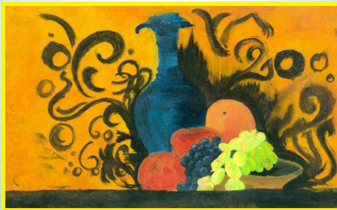
Art by - Namburi Lakshmi Sai Pravardhana - Mi.G.C - 2