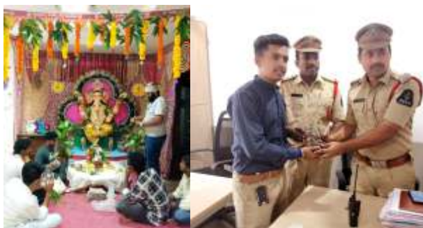
Aurora's Degree & PG College

Ganesh Utsav is one of the most celebrated