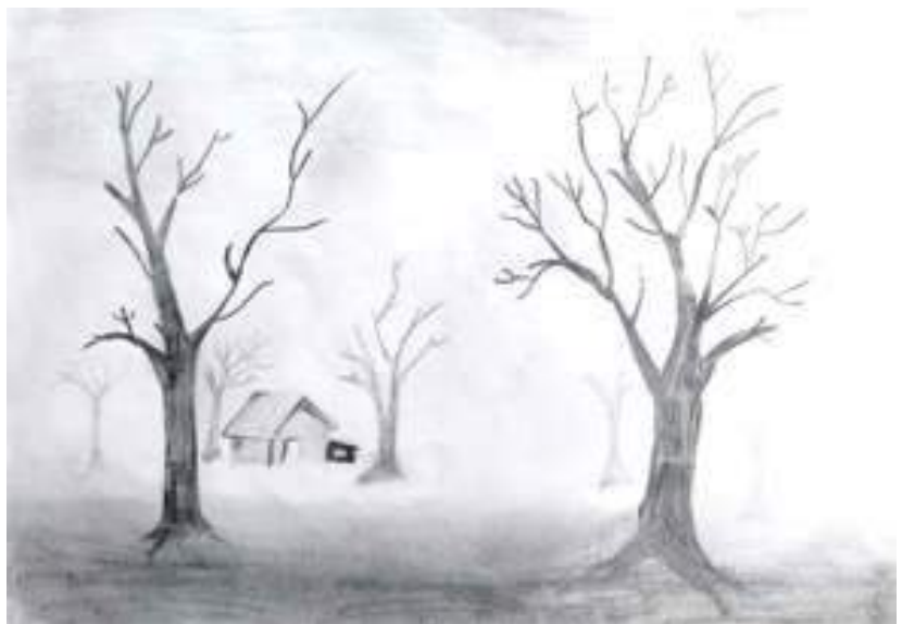
- Leeisha kothari (B Com 2C)