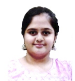
B. Prerna MPCs IIIB